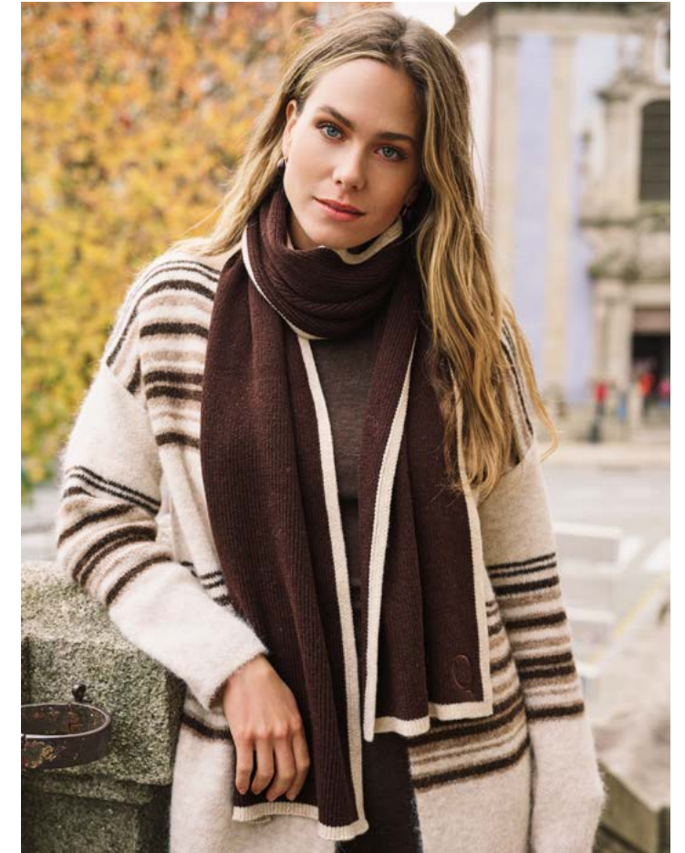
Q Cardigan F26.18504 | Scarf F26.07552