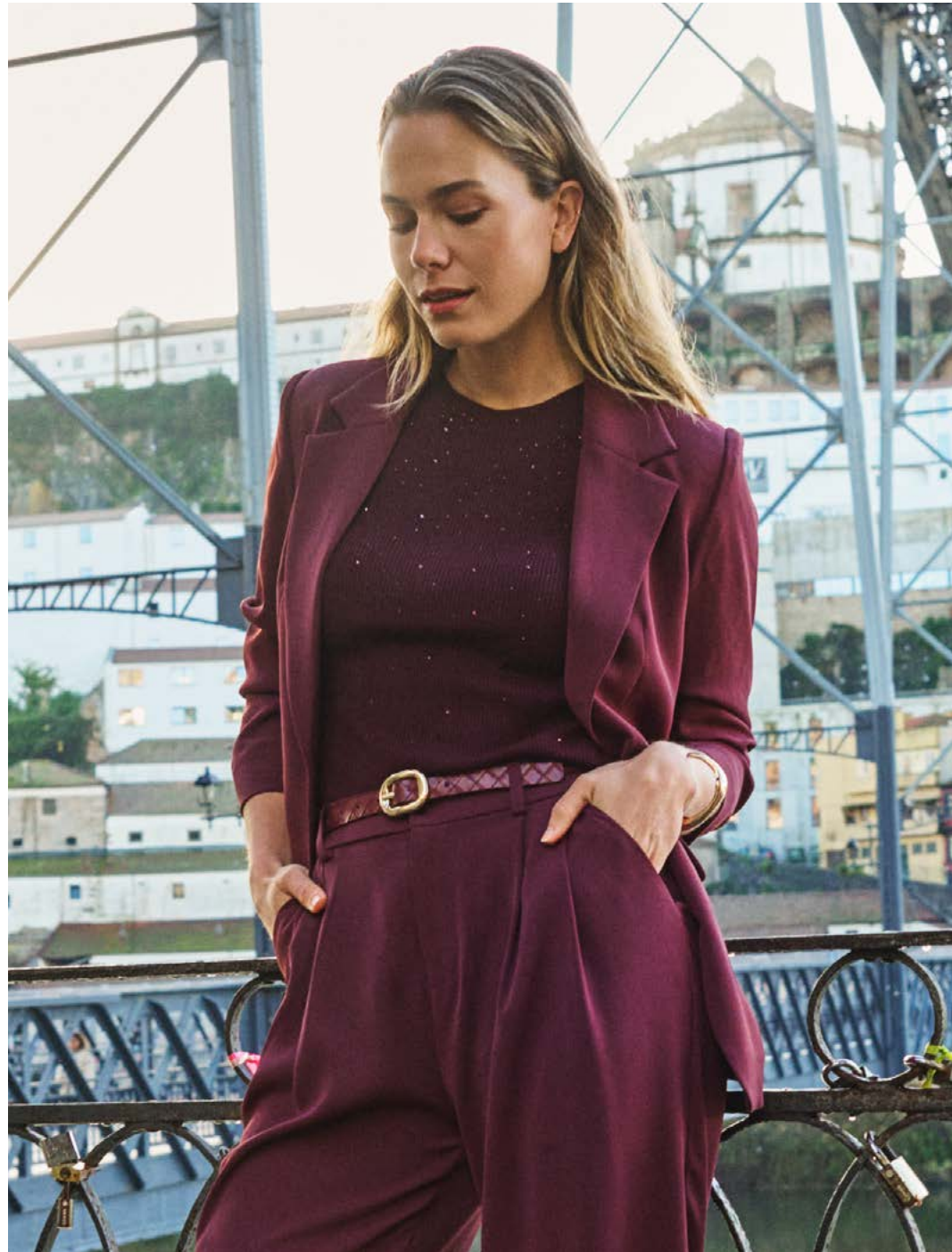
Q Blazer F26.10501 | Sweater F26.02539 | Trousers F26.10502