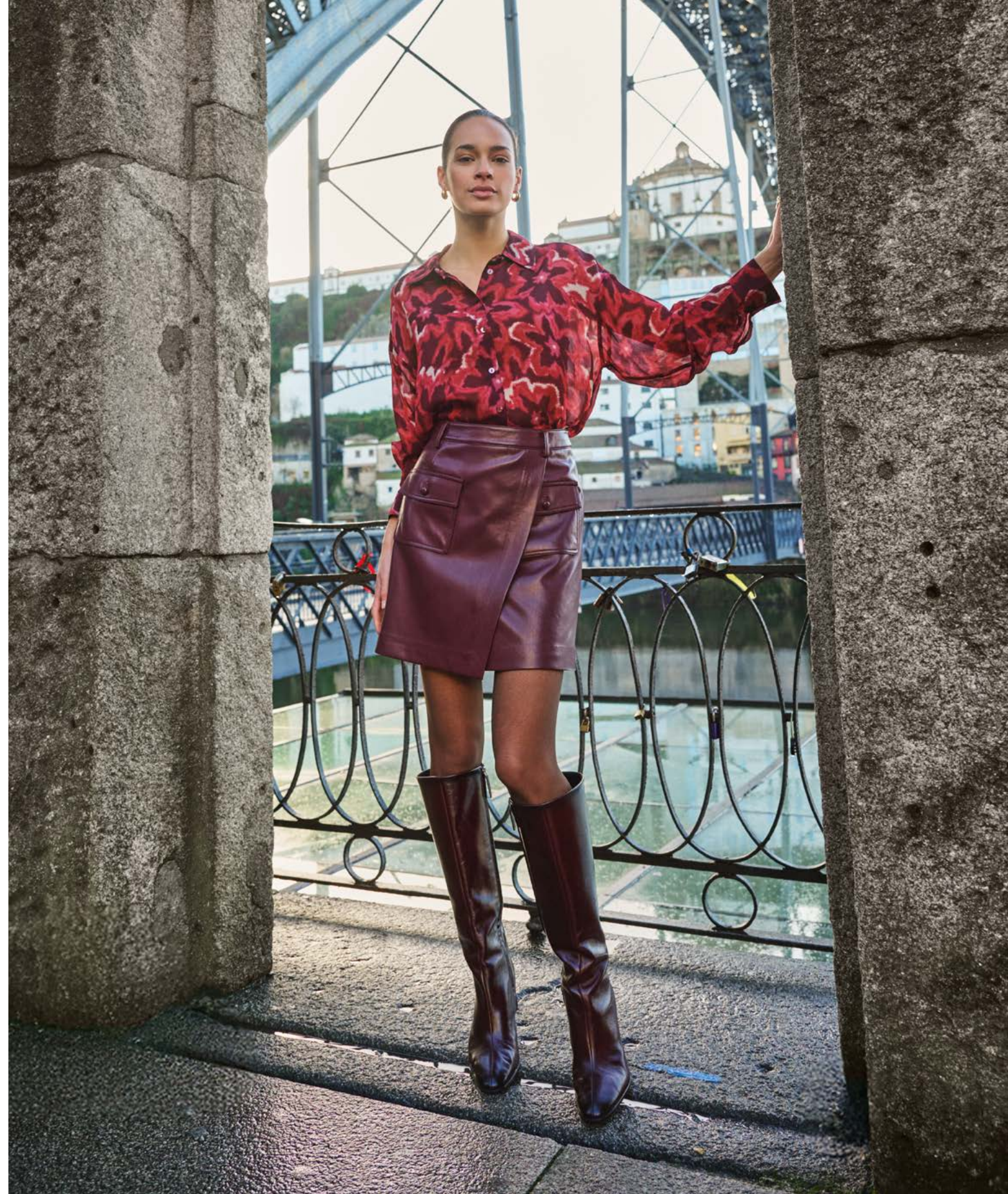
Q Blouse F26.14512 | Skirt F26.11507