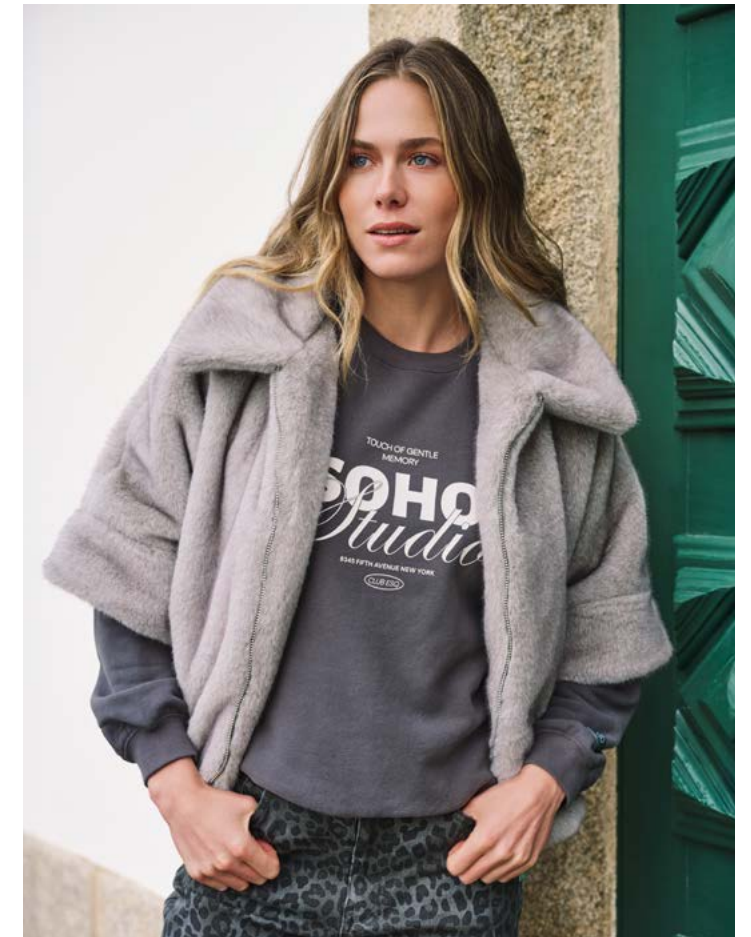
Q Coat F26.37500 | Sweater F26.05541 | F26.12509