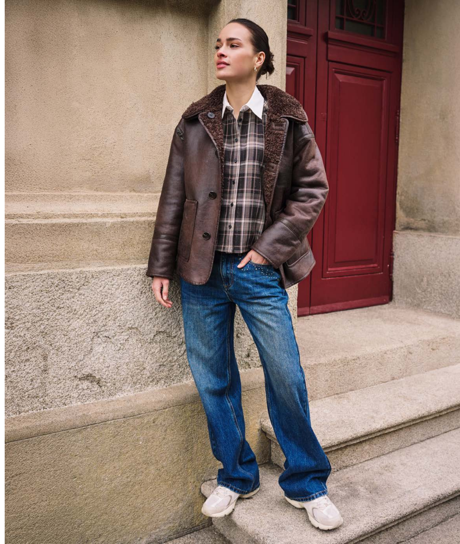
Q Coat F26.37509 | Blouse F26.28512 | Trousers F26.12515