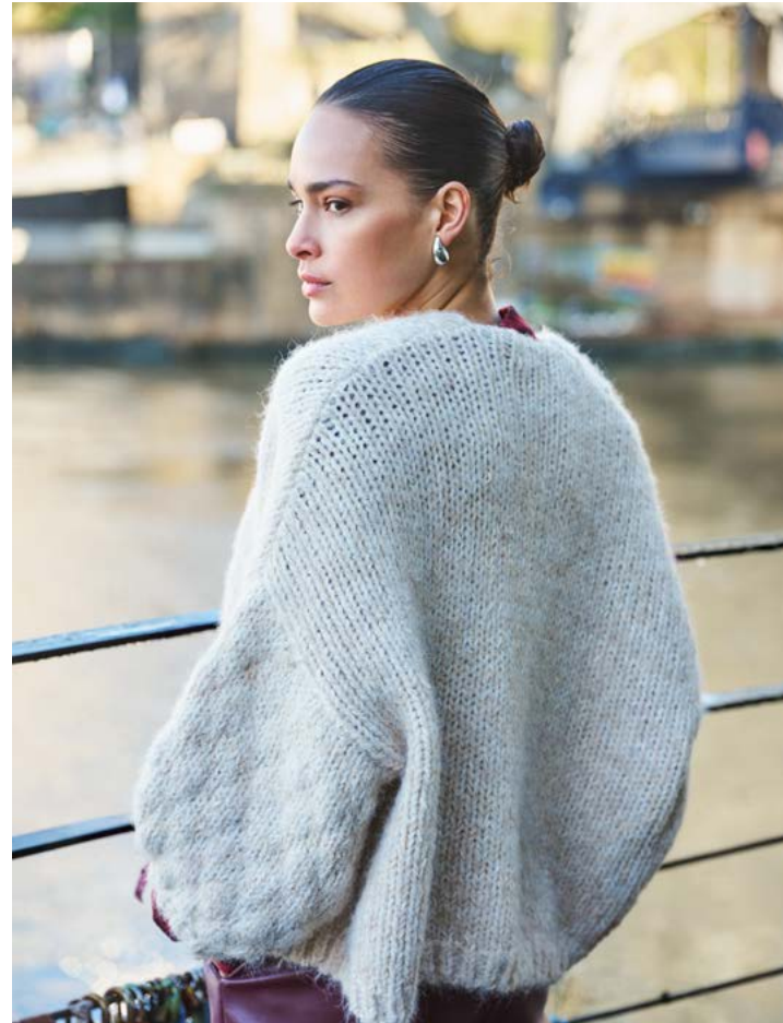
Q Cardigan F26.07502