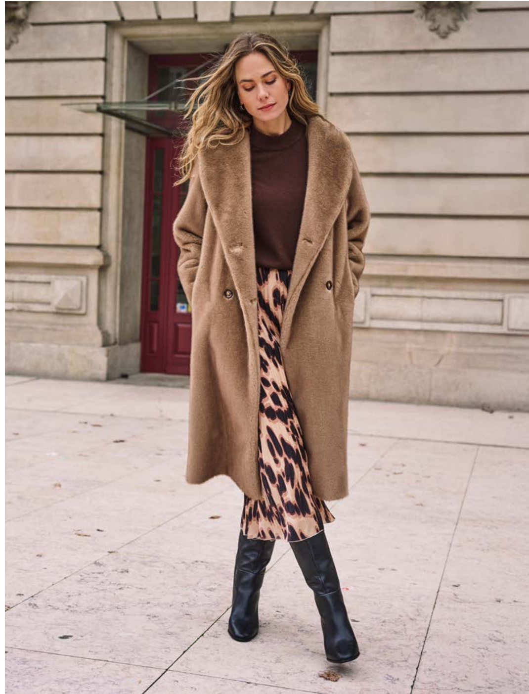
Q Coat F26.37521 | Sweater F26.27505 | Skirt F26.14502