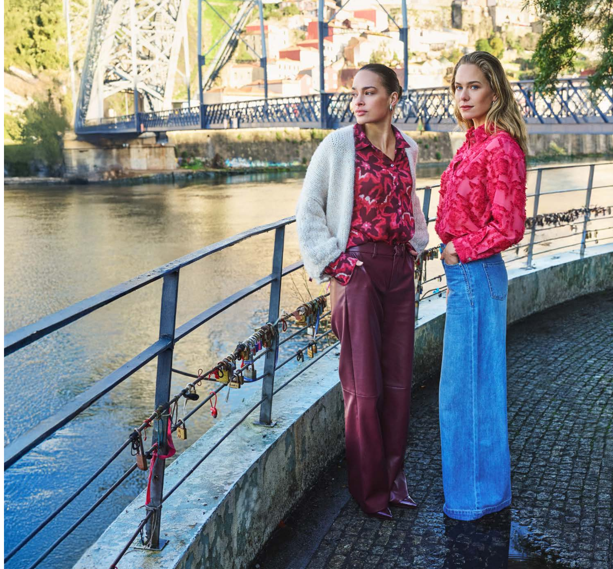
Q Cardigan F26.07502 | Blouse F26.14512 | Trousers F26.11504 Q Blouse F26.15508 | Trousers F26.12500