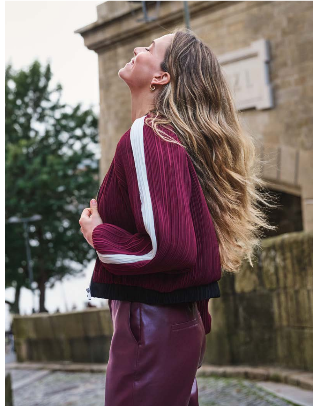
Q Jacket F26.28500 | Trousers F26.11504