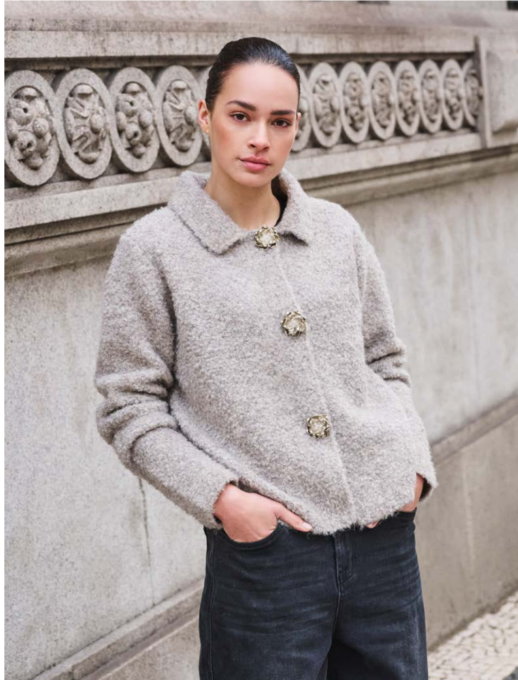
Q Cardigan F26.02510 | Trousers F26.12507