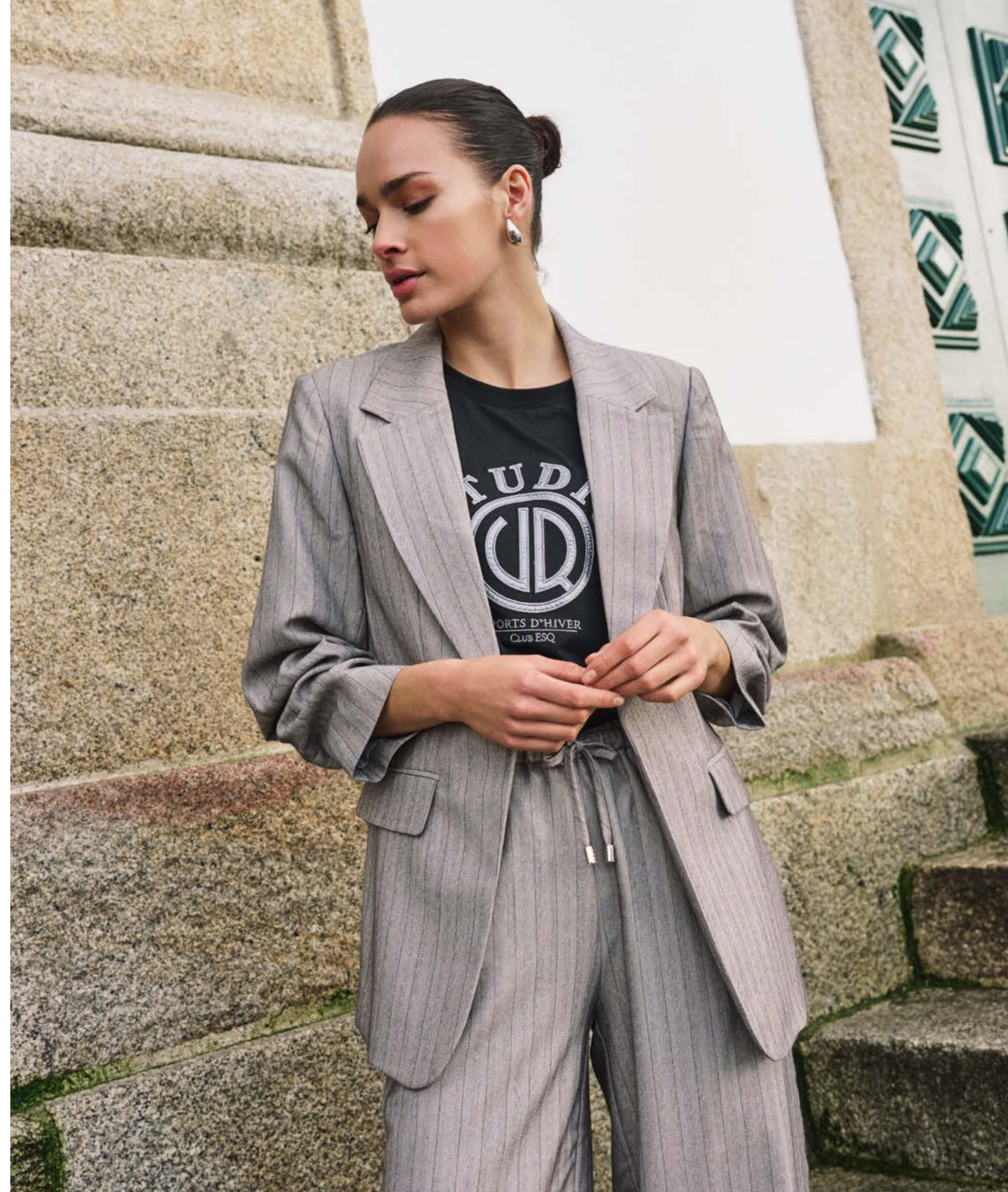
Q Blazer F26.10509 | T-shirt F26.05537 | Trousers F26.10510