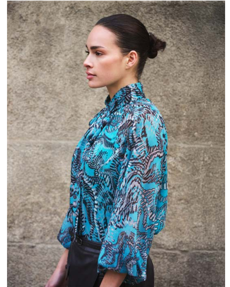
Q Blouse F26.14524 | Skirt F26.11507