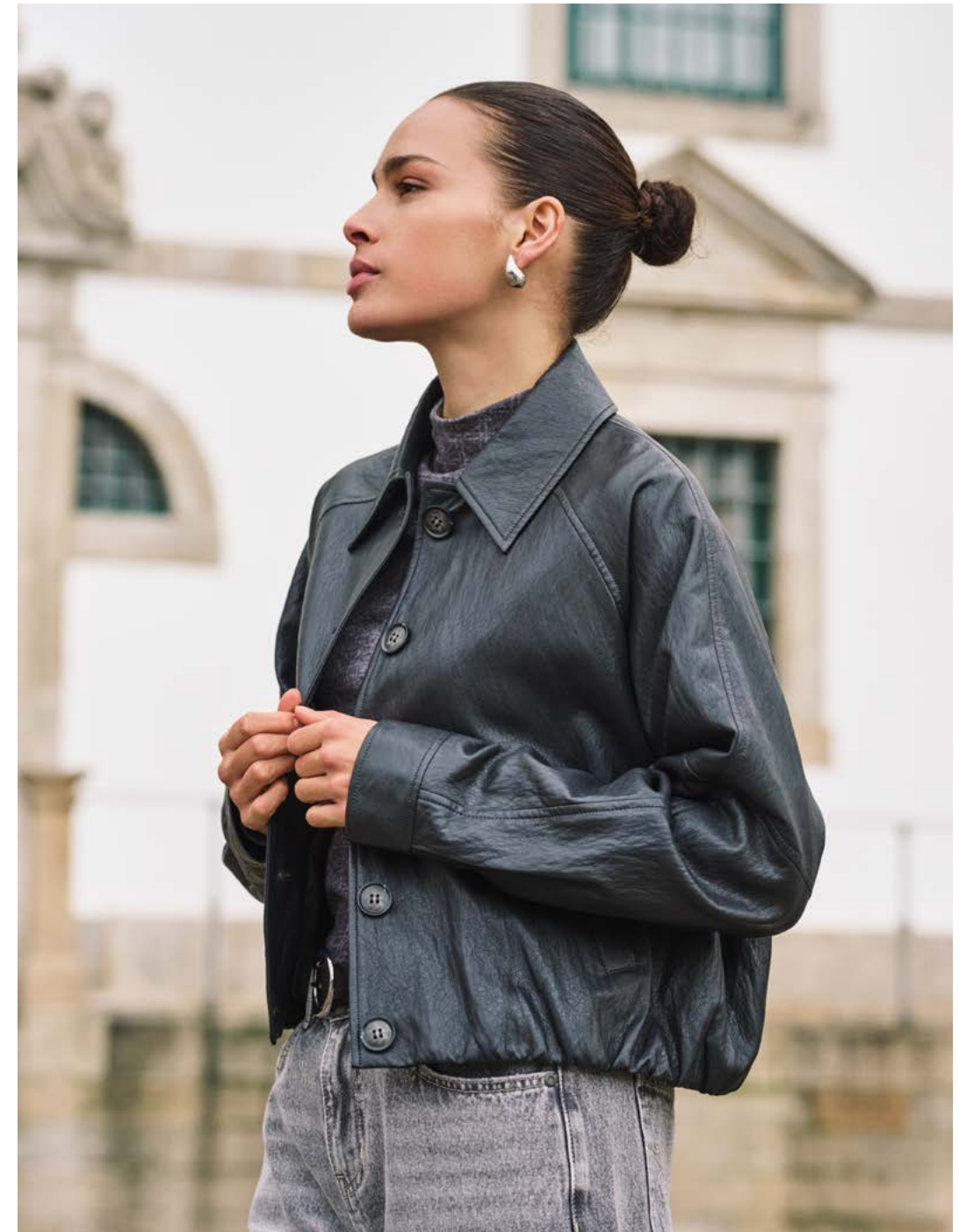
Q Jacket F26.11503 | Top F26.30512 | Trousers F26.12504