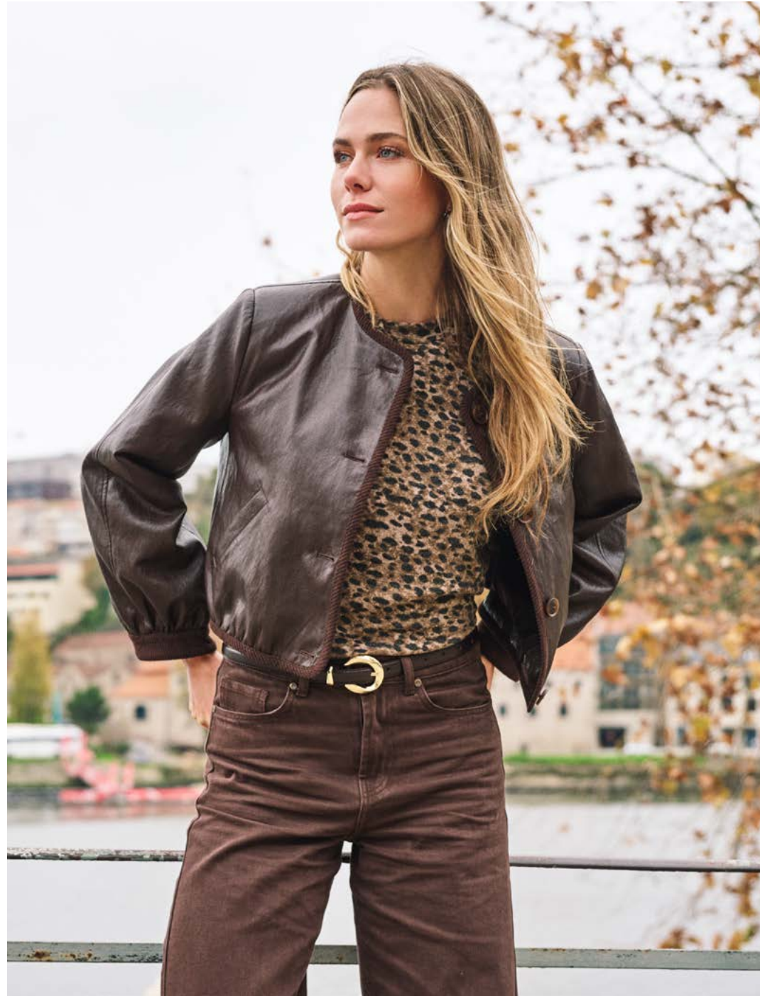
Q Jacket F26.11512 | Top F26.30516 | Trousers F26.12513