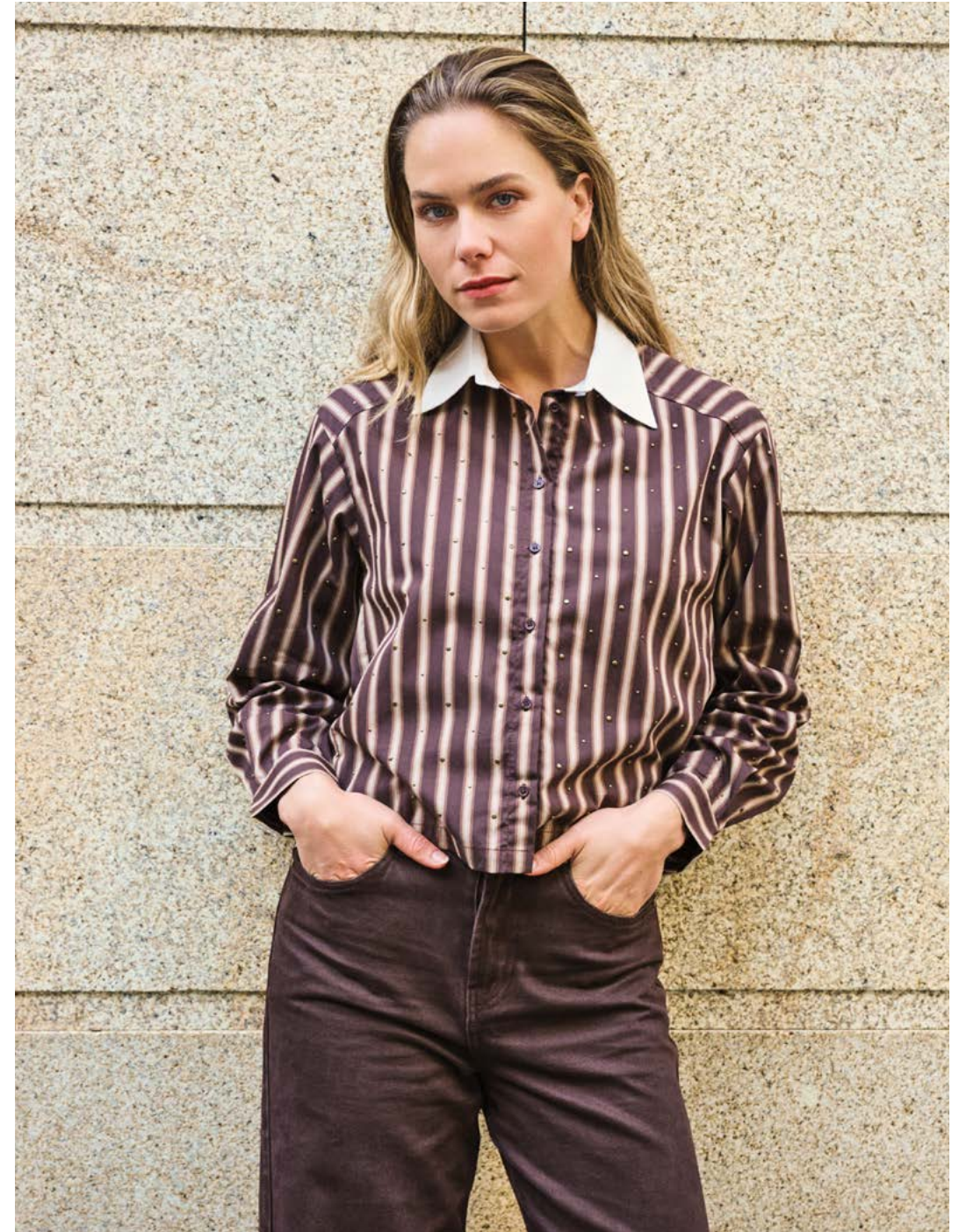
Q Blouse F26.28514 | Trousers F26.12513