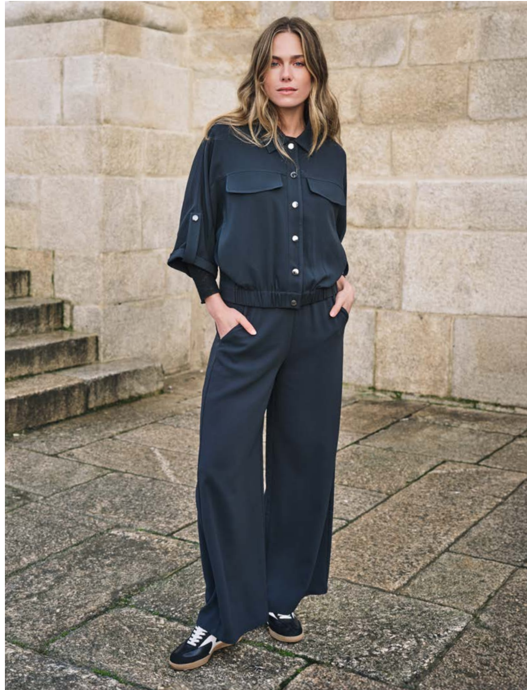
Q Blouse F26.10527 | Trousers F26.10529