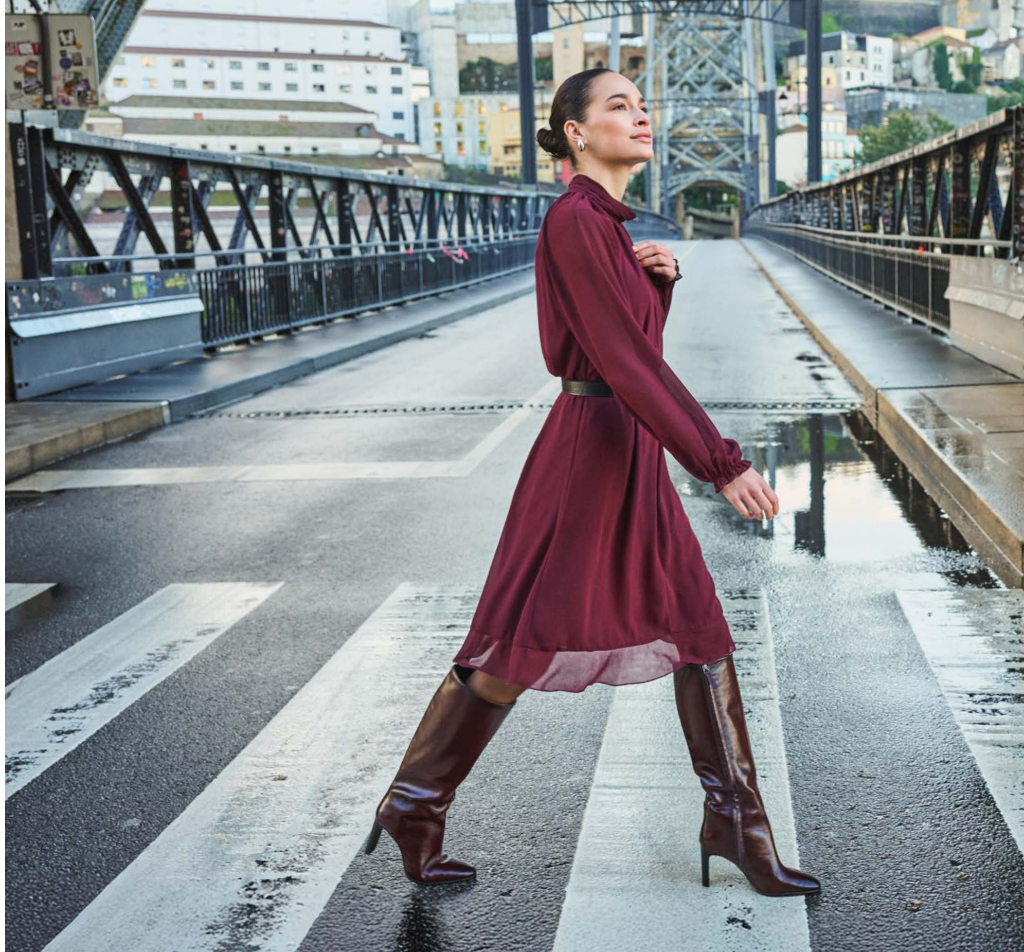
Q Dress F26.15503