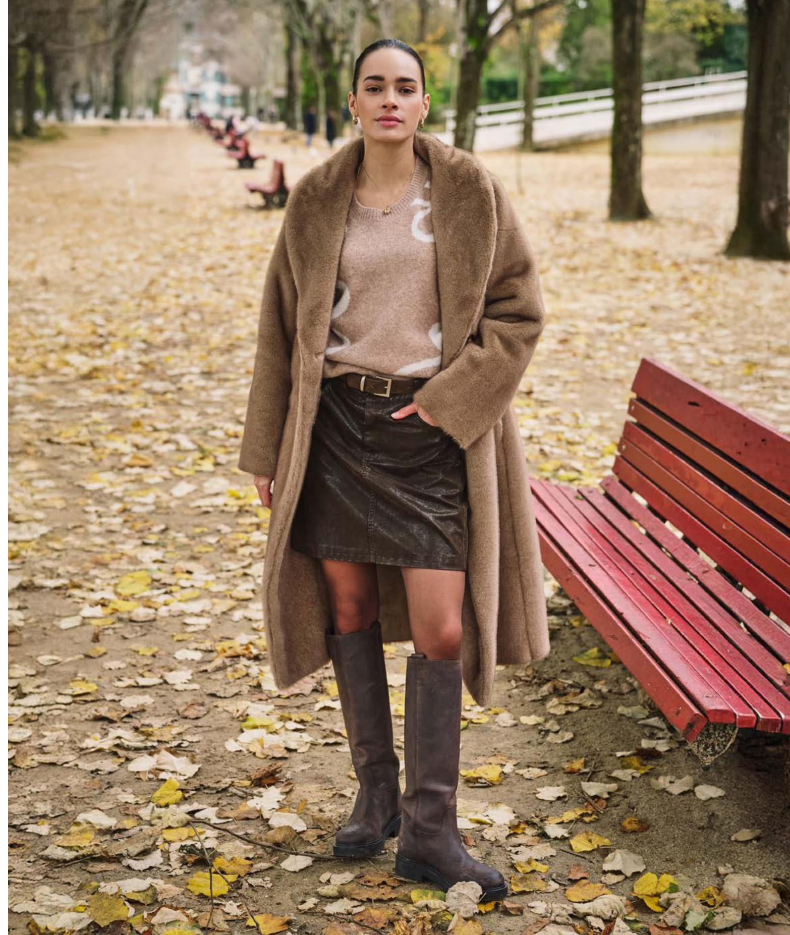
Q Coat F26.37521 | Sweater F26.02505 | Skirt F26.11515