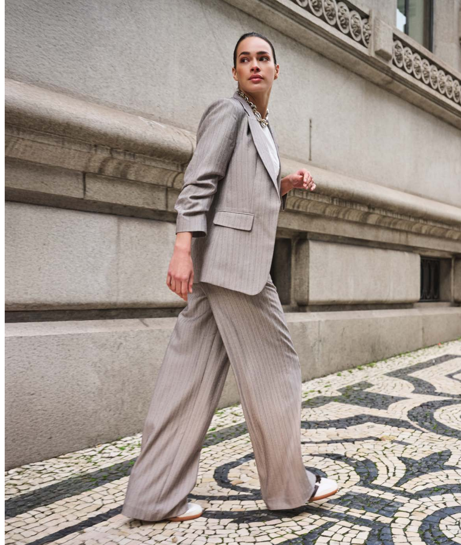
Q Blazer F26.10509 | T-shirt F26.05534 | Trousers F26.10510