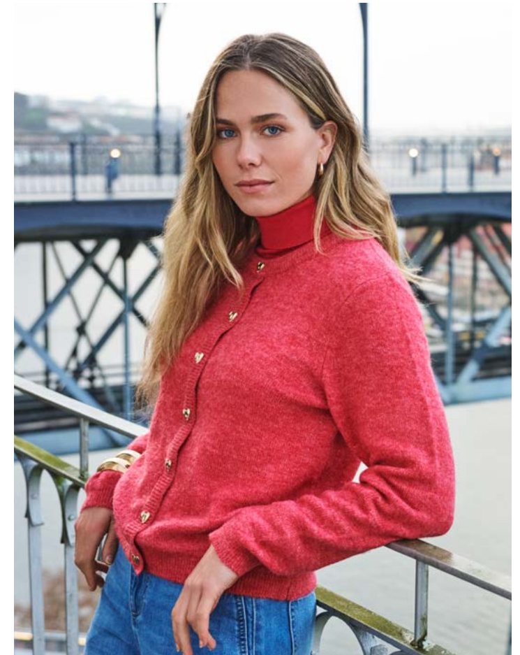
Q Cardigan F26.07510 | Sweater F26.07544 Trousers F26.12500 F26.12503