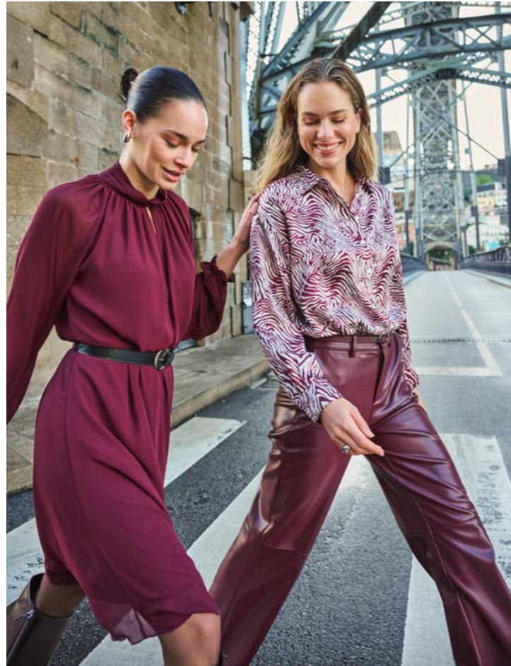
Q Dress F26.15503 Q Blouse F26.14521 | Trousers F26.11504