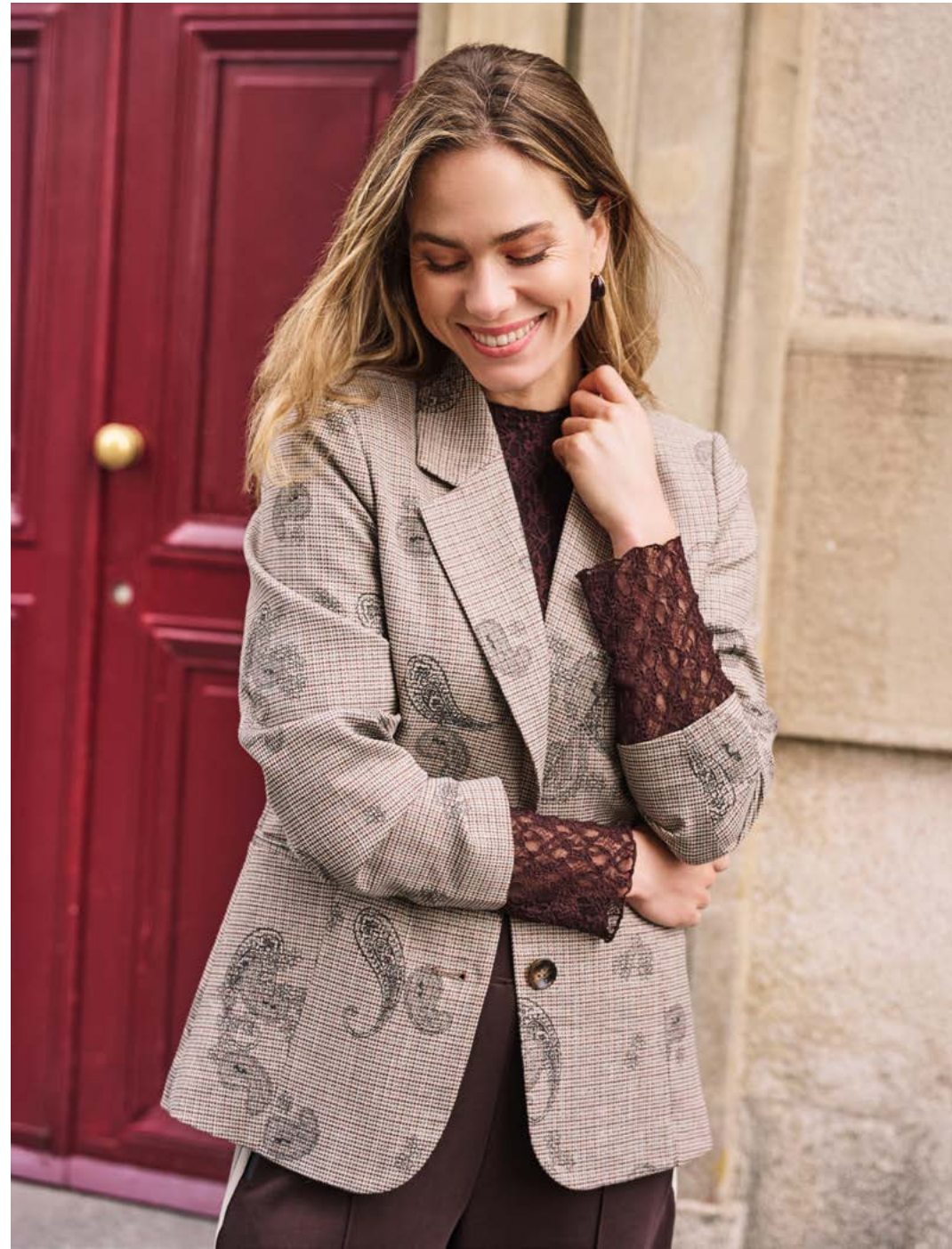
Q Blazer F26.17507 | Top F26.30504 Trousers F26.05506