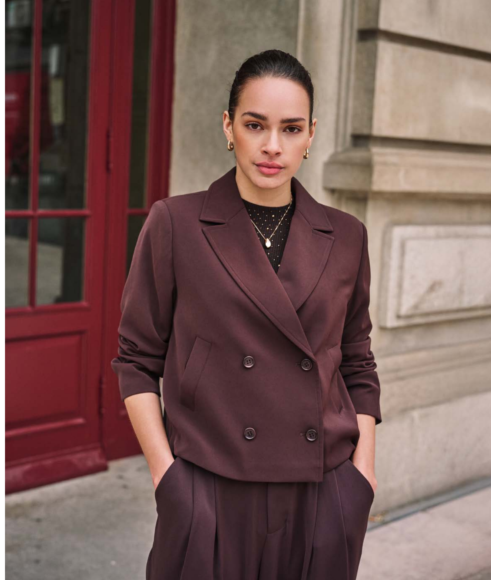
Q Blazer F26.10500 | Top F26.02539 | Trousers F26.10502