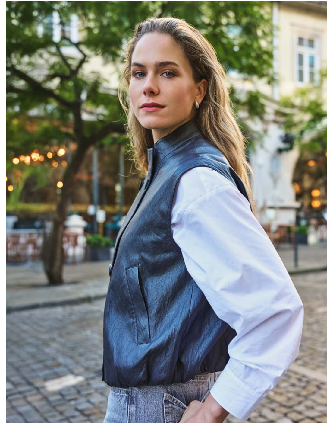
Q Gilet F26.11509 | Blouse F26.10532 | Trousers F26.12504