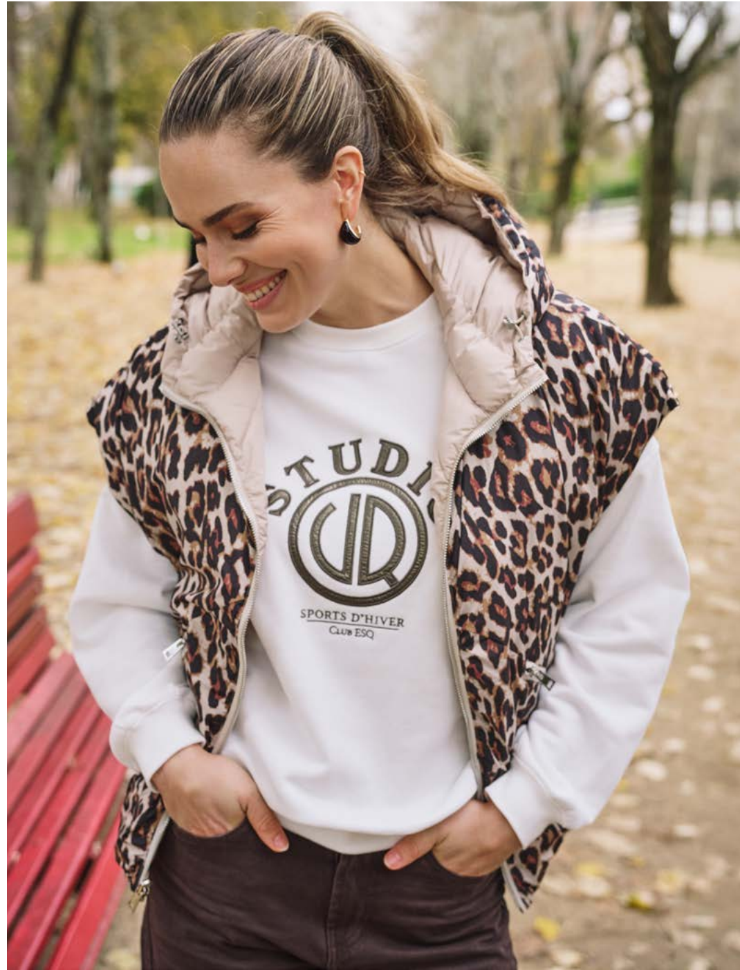
Q Poncho F26.37511 | Sweater F26.05540 | Trousers F26.12513