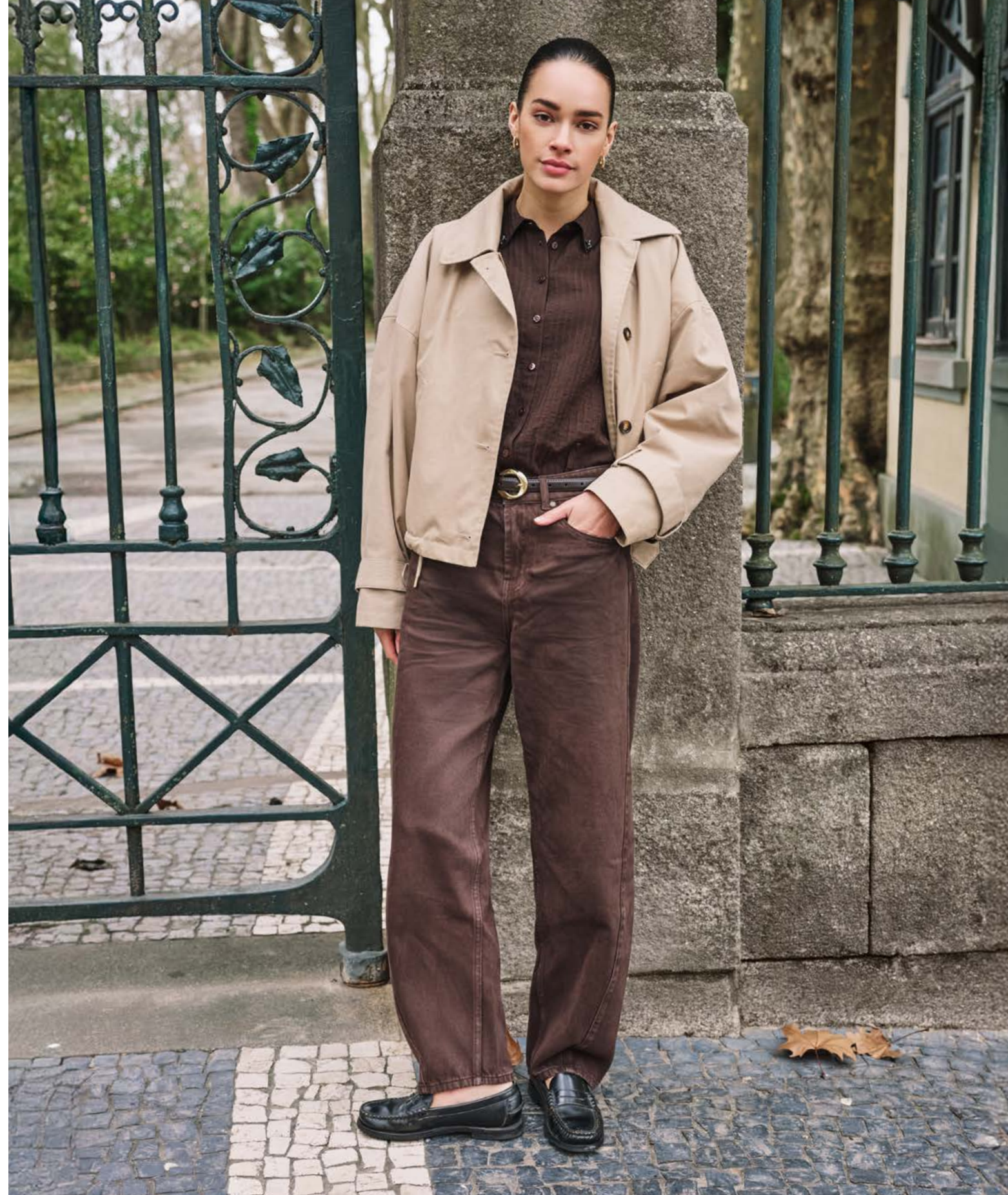
Q Coat F26.37504 | Blouse F26.15505 | Trousers F26.12513